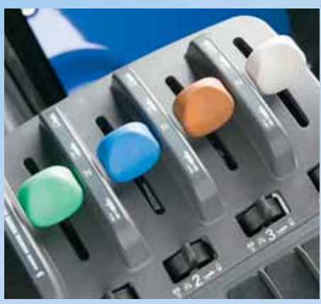
Hydraulic control levers and couplers are color-coded for ease of hook-up and to help track hydraulic operations.

high-flow, low-pressure system from another. With MegaFlow hydraulics, you can easily operate high-demand implements such as air seeders, planters and beet lifters with complete confidence.